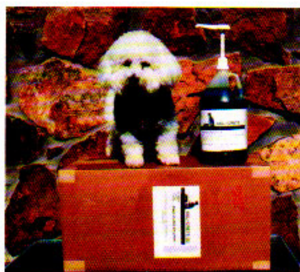
Architects' Specified Choice